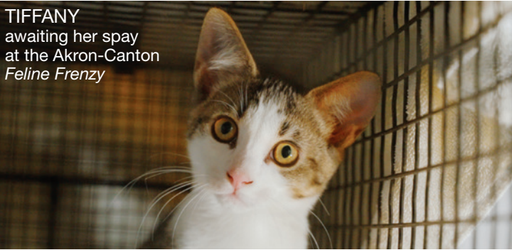
TIFFANY awaiting her spay at the Akron-Canton Feline Frenzy

Alley Cat Allies headed to Ohio in early September to kick off our Feline Frenzy with a humane trapping session alongside local advocates. Tiffany, Kyle, and Cindy would be just some of the cats who were spayed or neutered, vaccinated, eartipped, and microchipped the next day at the Feline Frenzy Trap-Neuter-Return (TNR) clinic.