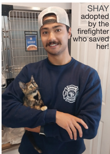
SHAY adopted by the firefighter who saved her!

Alley Cat Allies goes to any heights to save cats' lives! When members of our team in New Jersey learned about small kittens trapped on the roof of a police station, they swiftly set a rescue in motion with first responders.