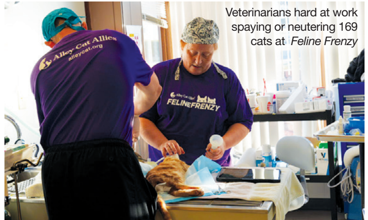
Veterinarians hard at work spaying or neutering 169 cats at Feline Frenzy

Alley Cat Allies' Feline Frenzy brings together animal protection groups, veterinarians, caregivers, and community members to make a long-term positive impact for cats. It's about critical veterinary care for cats in the here and now, but also about investing in the humane education of the community to help even more cats into the future.