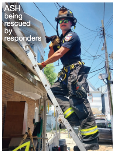
ASH being rescued by responders