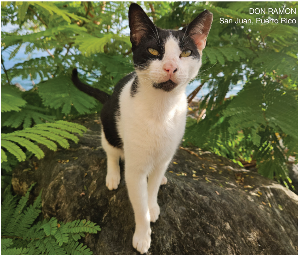
DON RAMON San Juan, Puerto Rico

POST with your own words on social media about what protecting these cats means to you and include #SaveSanJuanCats . Tell the NPS: Don't Kill Puerto Rico Cats.