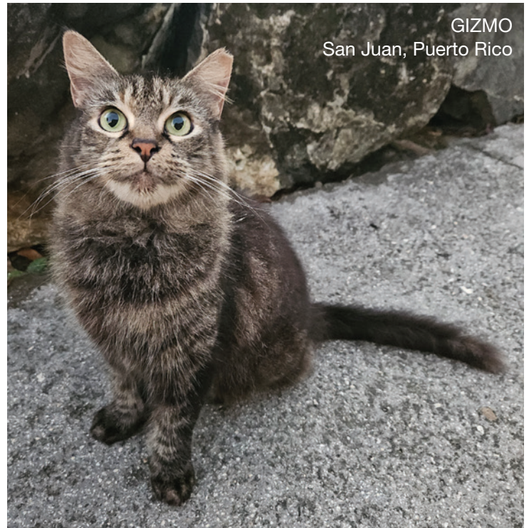
GIZMO San Juan, Puerto Rico

SHARE Alley Cat Allies' social media posts and spread the word. We have to raise our voices immediately for the cats, and it can be as simple as a click.