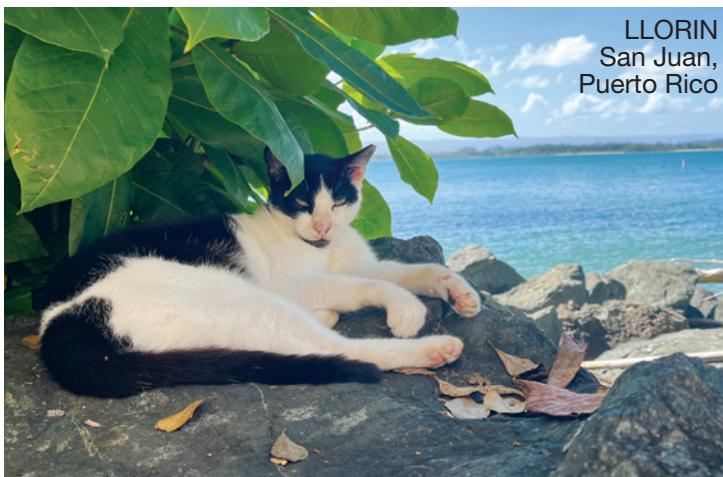
LLORIN San Juan, Puerto Rico

The lives of cats like Llorin, Don Ramon, and Gizmo are depending on us right now.