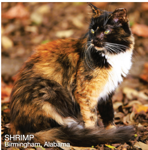
SHRIMP Birmingham, Alabama

After discovering that owned and community cats faced deadly policies in Birmingham, Alley Cat Allies called on the city and its mayor to cease persecuting cats and their caregivers immediately.