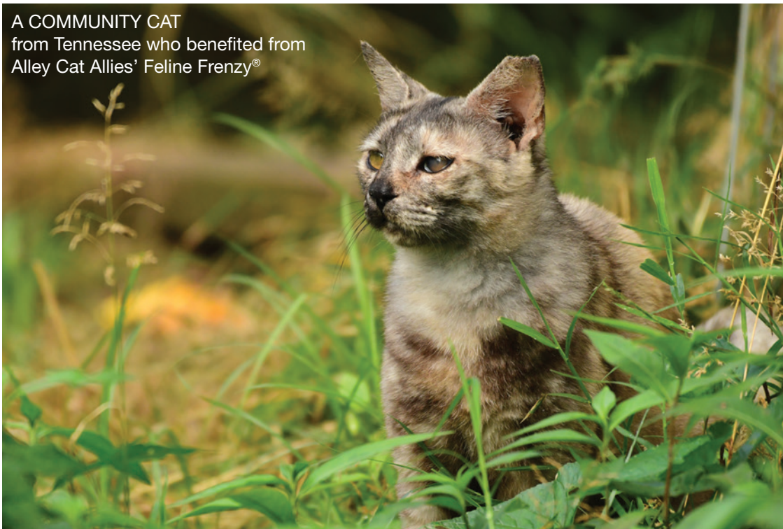
A COMMUNITY CAT from Tennessee who benefited from Alley Cat Allies' Feline Frenzy®

Learn how you can take more action at GlobalCatDay.org .