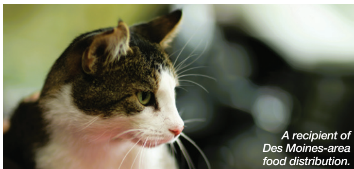
A recipient of Des Moines-area food distribution.