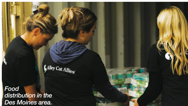
Food distribution in the Des Moines area.