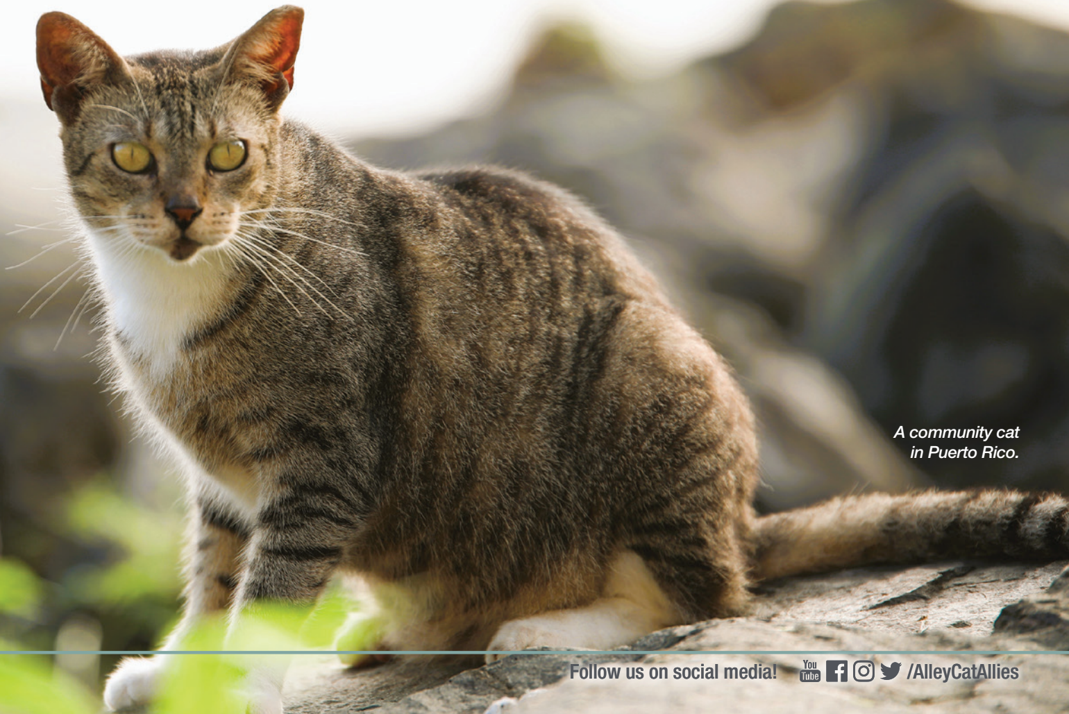
A community cat in Puerto Rico.

(See Protecting Puerto Rico's Cats on page 2)