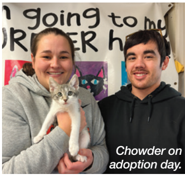
Chowder on adoption day.