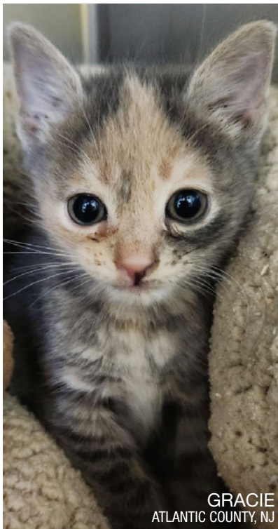
GRACIE ATLANTIC COUNTY, NJ