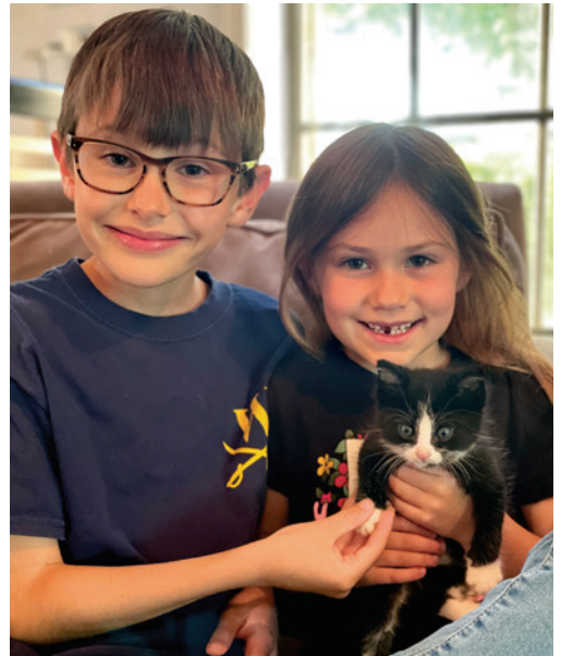
Out of the rubble and into the arms of a new family! Thanks to Alley Cat Allies' tornado relief grant in Mississippi, Nado was rescued, cared for, then adopted.

Today, Poppy, Lily, and dozens of other kittens have not only come back from the brink of tragedy wrought by the tornadoes, but are on their way to many bright, sunny days ahead.