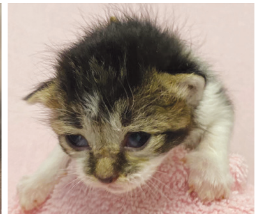
Zayna, Morel, and Hehe are just three of the kittens transferred, treated, and saved through Alley Cat Allies' emergency response grant in Dallas.