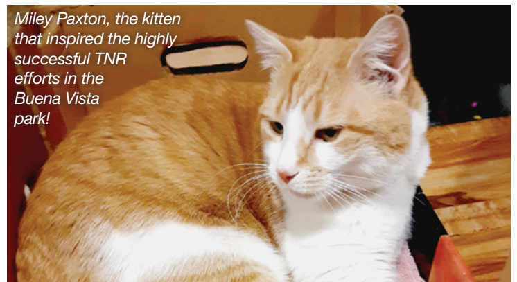
Miley Paxton, the kitten that inspired the highly successful TNR efforts in the Buena Vista park!