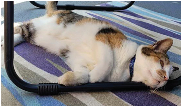
Cubby relaxing in her adoptive home after recovering from surgery to salvage her paws after declawing. Alley Cat Allies covered those costs.

Cubby and many other cats now have a new lease on life thanks to surgery and pain management. But here's the truth: the only way to truly protect cats from declawing is to make it illegal—everywhere.