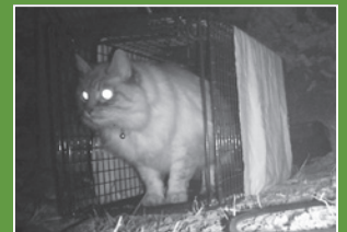
The rescue plan in the aftermath of the Marshall Fire in Boulder County, CO, included trail cameras to identify displaced cats. These are just some of the images captured.