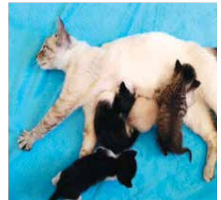
Thanks to our COVID-19 response work, young mother cat CeeCee and her kittens got the critical care they needed.

Here are just some of the stories of cats and kittens we've protected this year. Our supporters like you make it all possible, and we thank you deeply. (continued on page 5)