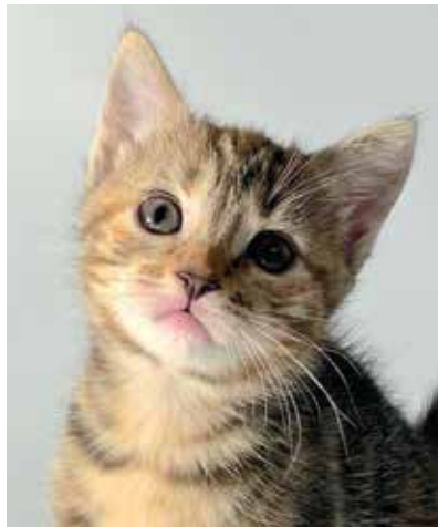
Lloyd is one of the many kittens our COVID-19 emergency funding has protected.

Alley Cat Allies' mission, no matter the circumstances or challenges, is to improve the lives of cats (like Squeak, who you'll learn about very soon). We believe each cat and kitten is an individual whose life has intrinsic value and deserves actions taken with their best interests at heart. We know you do, too.