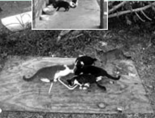
ACA volunteers set up feeding stations for feral colonies whose caregivers have been unable to return.