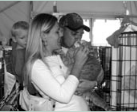
Named for his likeness to Forrest Gump, Gumpy and his family were thrilled to find each other.