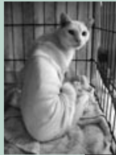
Blizzard, above, suffered serious trauma that ruptured her diaphragm and made it difficult for her to breathe. Here she is recovering from surgery.