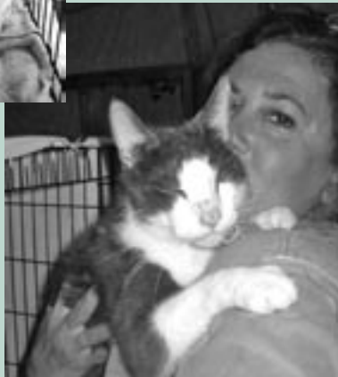
Sycamore, an older kitty, is grateful for some comfort from a volunteer.