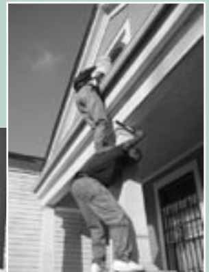
Karlyn Sturmer stands on broad shoulders to rescue a cat trapped in the attic.