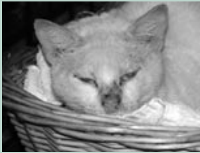
This kitty was rescued in the Superdome weeks after the storm.