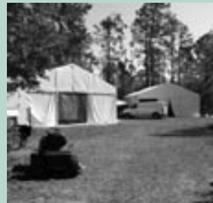
Tents to shelter the cats at the ACA base camp in Bogalusa.