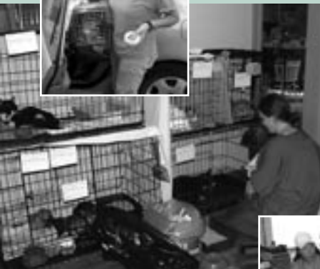
ACA volunteers were the backbone of the rescue operation. We could not have done this without them.