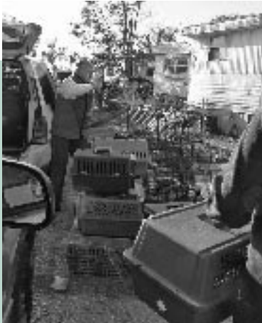
Volunteers unload traps and carriers at the Kenner trailer park.

Unfortunately, Michael Court was a home of last resort for many residents. Out of money and still waiting for help from FEMA, they had no place to go. Without gas or water,