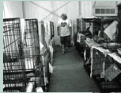
A volunteer patrols the rows of cages checking on the rescued cats in the 30 X 30 foot air-conditioned tent.